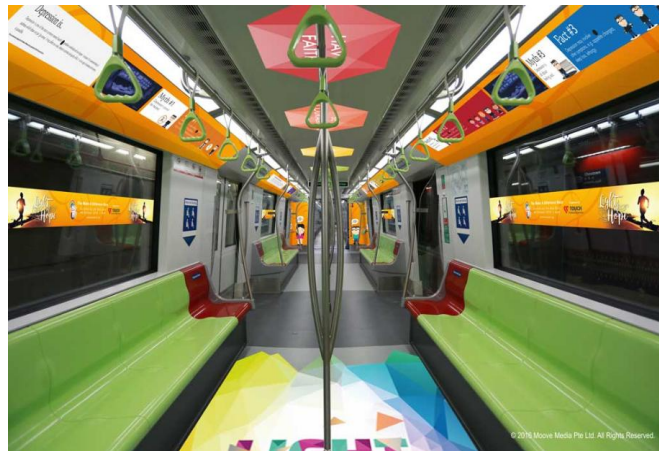
An artist's impression of The Make A Difference Race-themed train cabin.

SINGAPORE, 23 June 2016 – TOUCH Community Services (TOUCH) today launched a specially commissioned themed train on Singapore's newest MRT Line – Downtown Line – as part of the campaign for The Make A Difference Race 2016 , a mental health awareness run taking place on 8 October 2016 at Gardens by the Bay East.